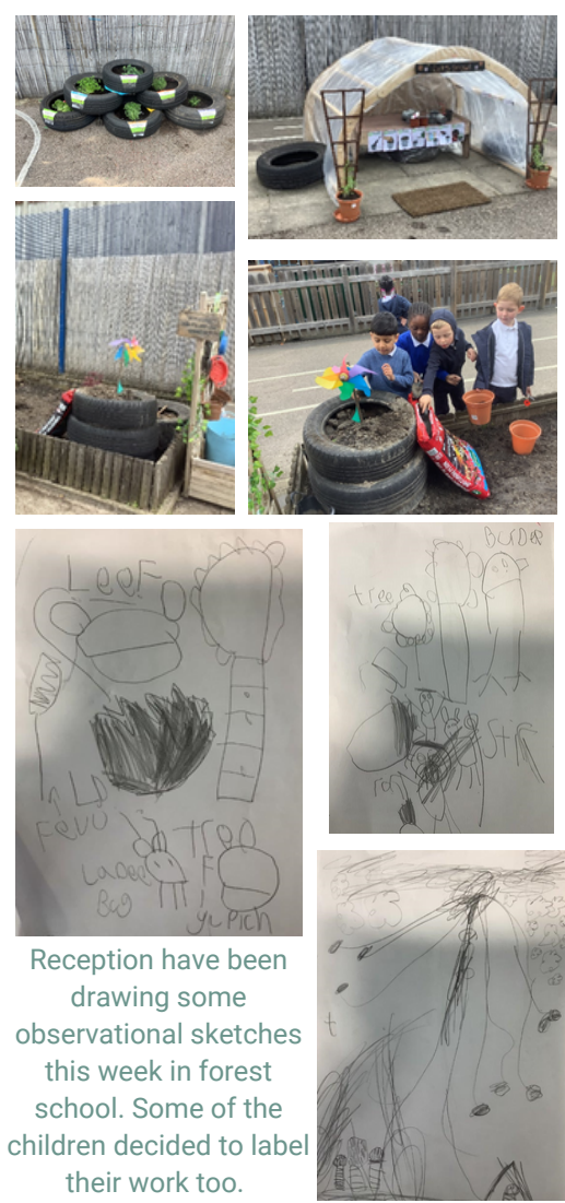
Reception have been drawing some observational sketches this week in forest school. Some of the children decided to label their work too.